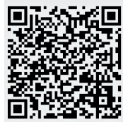
Scan to schedule an appointment.

Dec. 13, 9AM–2PM: Red Cross Blood Drive in Plymouth Hall Save a life—give blood at The First Congo Red Cross Blood Drive! Schedule at 1-800-RED-CROSS or RedCrossBlood.org . Questions? Email jean@wscongo.org . Volunteers needed!